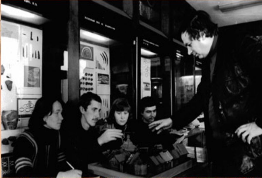
Archeological society, 1982