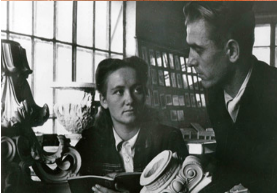
Student of the Faculty of History in the Museum, 1949.

Reconstruction of the Museum began together with the reconstruction of the University. As previous one, new exposition showed history of ancient time.